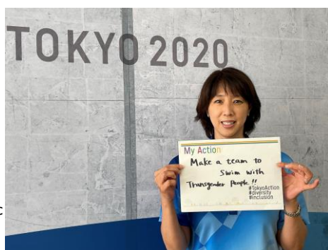
YAMAGUCHI Naohide (Paralympic Swimmer)