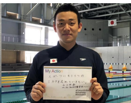
SHIBATA Ai (Olympic Swimmer)